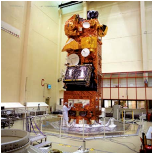
Figure 4: The Hydra Shaker tests satellites, but also large objects such as trains

Academic facilities within ESTEC and in Dutch research institutes, such as those of the Netherlands Organization for Scientific Research (NWO), are often already open to “outside” use. This sharing of facilities is not only an efficient use of financial resources, but also a way to bring people from different organizations together. As such, it underpins human capital development and the flow of people and ideas. Furthermore, Dutch experts are well positioned to engage in the maintenance and upgrading of these extremely sophisticated facilities, which is often outsourced. Although forms of facility sharing already exist, they can be developed further within the framework of the structured dialogue in recommendation 7.