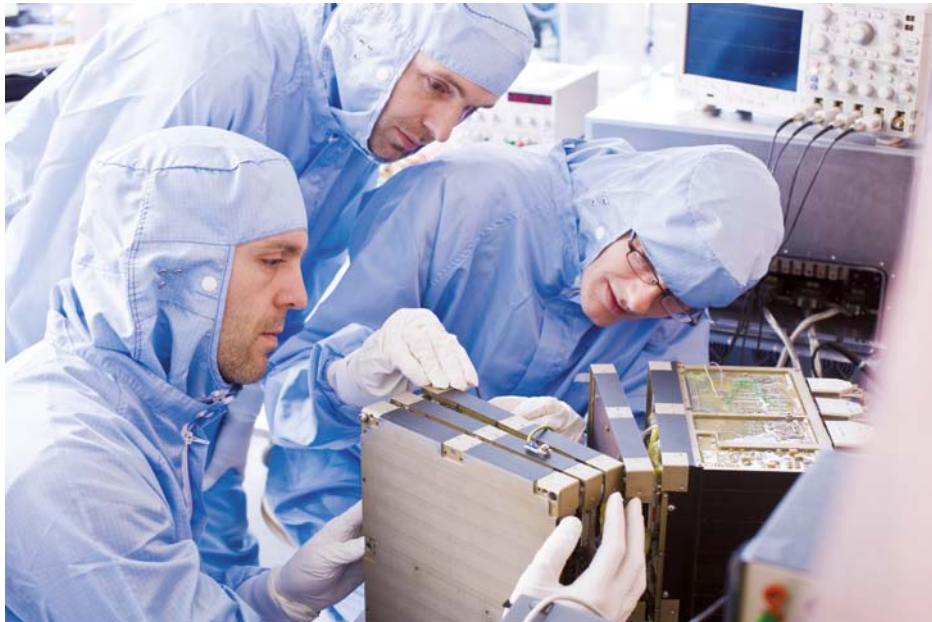
Figure 3: SRON develops instruments for use in space

Innovation comes from people. Therefore the top team feels that, in order to capitalize on the opportunities for technology transfer and economic and societal applications described in sections 2.1 and 2.2, stronger ties need to be developed between the people in Dutch academia, research institutes and ESTEC. The building blocks that form the foundation for strengthening these ties have already been established. Collaboration is already strong in some areas (such as the co-development of the Robotics Lab by ESTEC and TU Delft described under 1.3). These often ad hoc informal contacts can be turned into a structured dialogue to foster cooperation. There are programmatic ties between the mission advisory groups and scientific advisory groups for ESA programs and activities directed from ESTEC. Opportunities also exist for joint research projects under the European Research and Development programs.