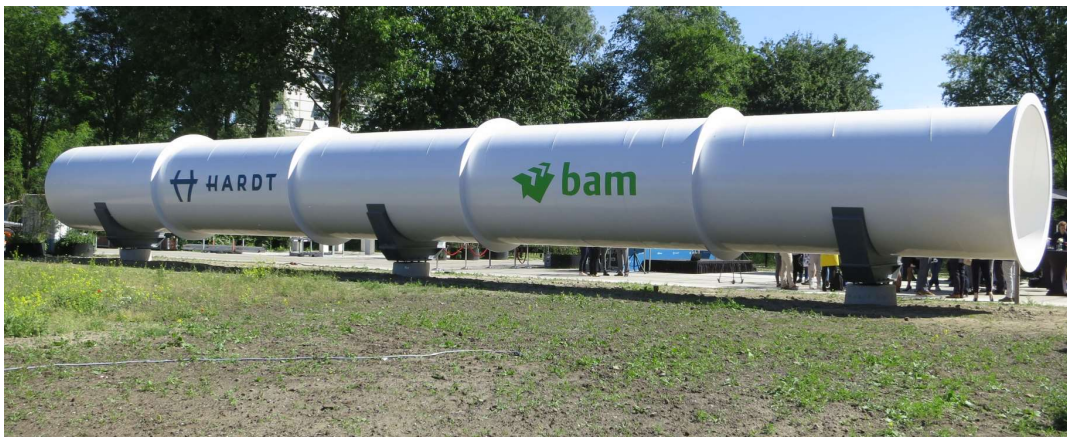
Figure 4. The 30 m test tube of Hardt at the campus of the TU-Delft.