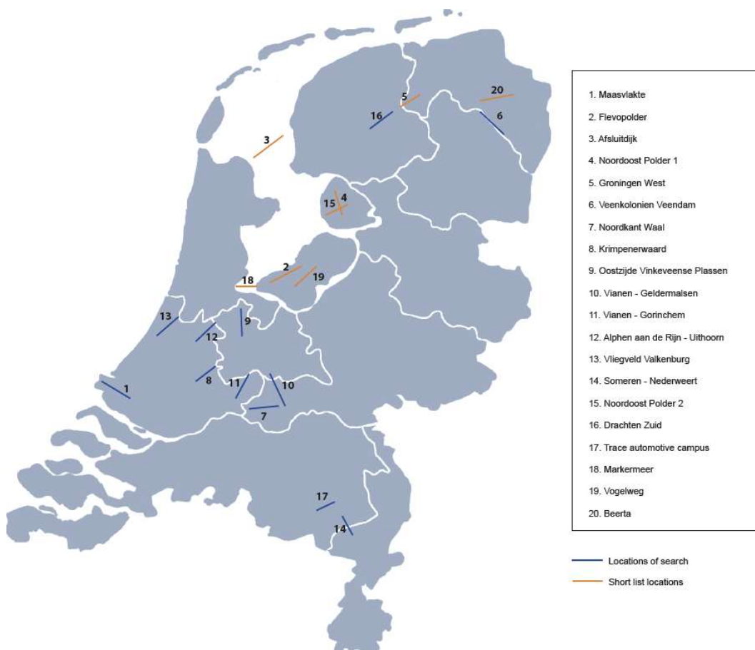
Figure 2. Potential hyperloop locations

The location analysis has been based on the earlier executed pre-feasibility study (Nov-Dec 2016). New insights on technical spatial constraints, in particular the geometrical requirements of the vertical and horizontal alignment and the radii necessary for achieving a curve on the basis of the technological analysis, have had an impact on the feasibility of spatial implementation of a test track and the choice of location. This resulted in 12 of the 17 locations from the pre-feasibility study not being considered suitable for a test track. Three new locations have been added to the list, leading to a shortlist of 8 locations. Thus in total, together with the 17 locations of the pre-feasibility study, 20 locations have been analyzed (see Figure 2).