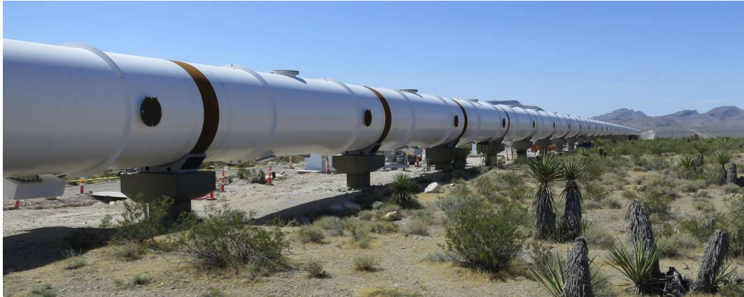
Figure 3. The 500 m long test tube of Hyperloop One in the Nevada dessert.

The main purpose of a 3 to 15 km long test track would be to get the hyperloop technologies from Technology Readiness Level (TRL) 4 to 6, up to TRL 7 or 8. It is most likely that Hyperloop One will start at TRL 6 or 7 due to the existing availability of a 500 m test track (see Figure 3). Hardt will most likely start at TRL 4 or 5 due to limited testing capabilities in the 30 m test tube at the campus of the TU Delft (Figure 4). In order to get to the final TRL 9 for the full system, a much longer test track of at least 40 km is required, depending on the maximum accelerations and decelerations of the pod. TRL 9 will need to be achieved before commercial operations can start.