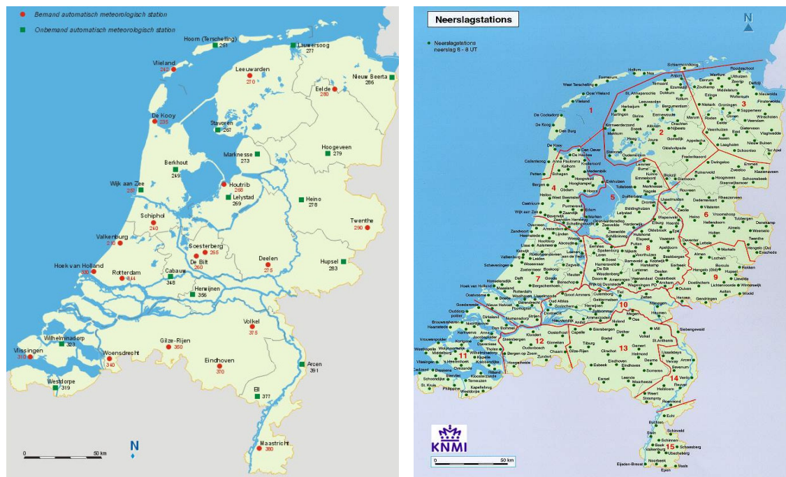
Figure 1 - Automatic meteorological station network in the Netherlands (left) and voluntary network for precipitation (right)

Global radiation is measured since 1957 starting with one station (De Bilt), expanding to 5 (1965), 6 (1984), 13 (1987), 32 (1999) and 33 at present.