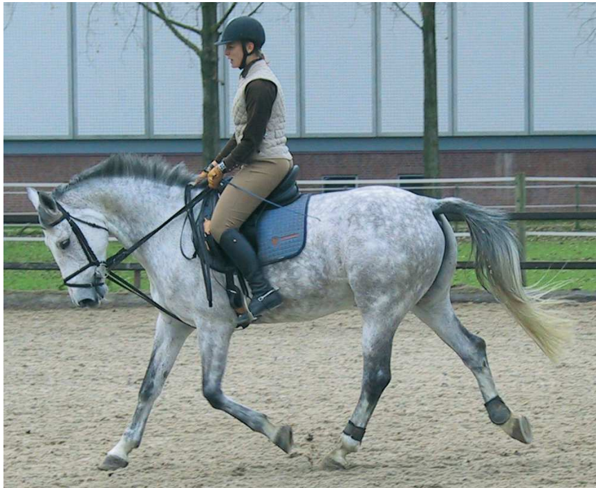
Figure 3. A horse ridden “rollkür” (round and deep with a draw rein) in the study of Sloet van Oldruitenborgh-Oosterbaan et al. (2006)

shows that the treatment resembled a posture in which the horses were ridden with the nose behind the vertical (comparable to HNP3 in Figure 2), but not with the chin onto the chest. Riders were not blind to the treatment and half of the horses started with a test in LDR, the other half of the horses in a test with a natural posture (comparable to HNP1 in Figure 2), with only light rein contact. During the tests horses were trotted and cantered for several minutes.